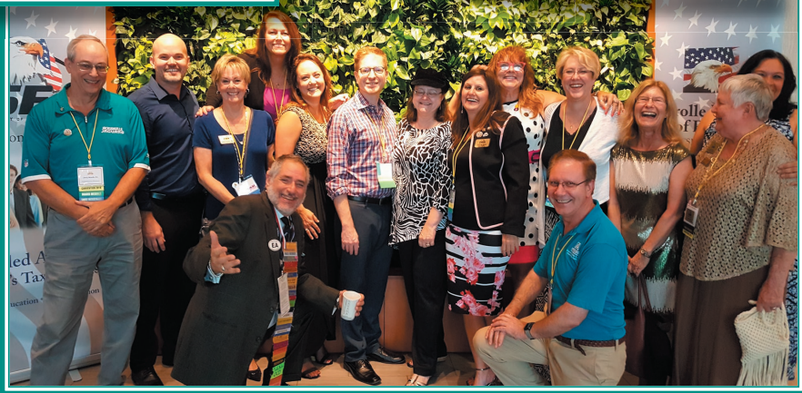
Greeting members & guests at our registration desk.