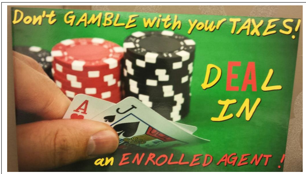
FSEA CONVENTION 2017 JUNE 22 – 24, 2017